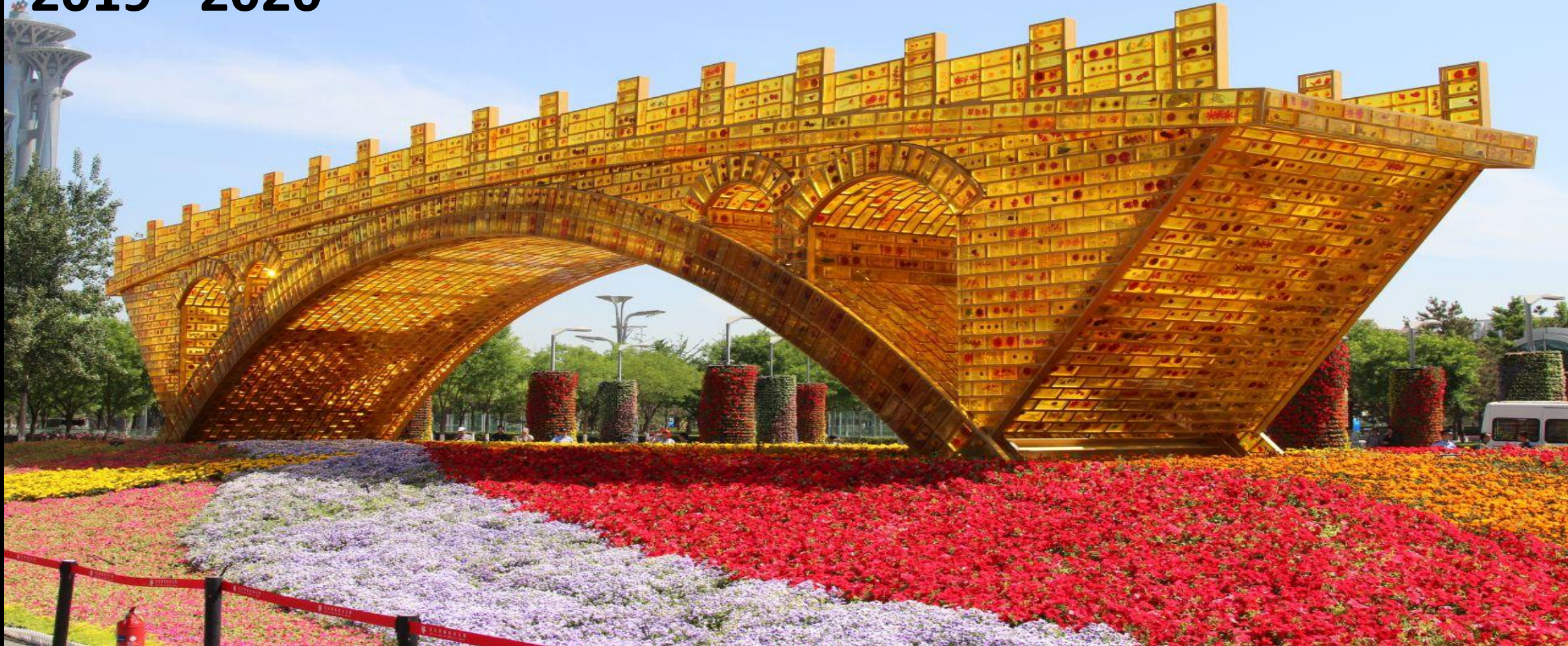
The 'Golden Bridge on Silk Road' built for the 1st Belt & Road Summit in Beijing